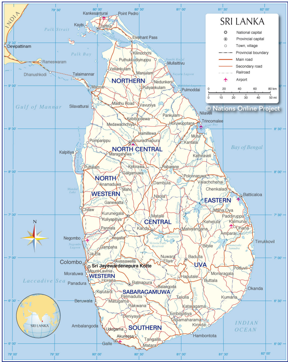
Figure 1. Administrative Map of Sri Lanka